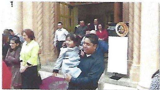
Worship Evacuation Drill